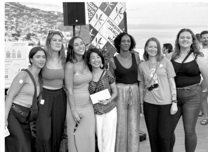
'Sustainable Summer in Madeira', promovido pela Greener Act, terminou com celebração no Barceló Funchal Oldtown.

Esta aplicação também dispõe de um 'Greener Market' [Mercado Verde], onde os utilizadores podem vender, comprar, trocar ou doar itens.